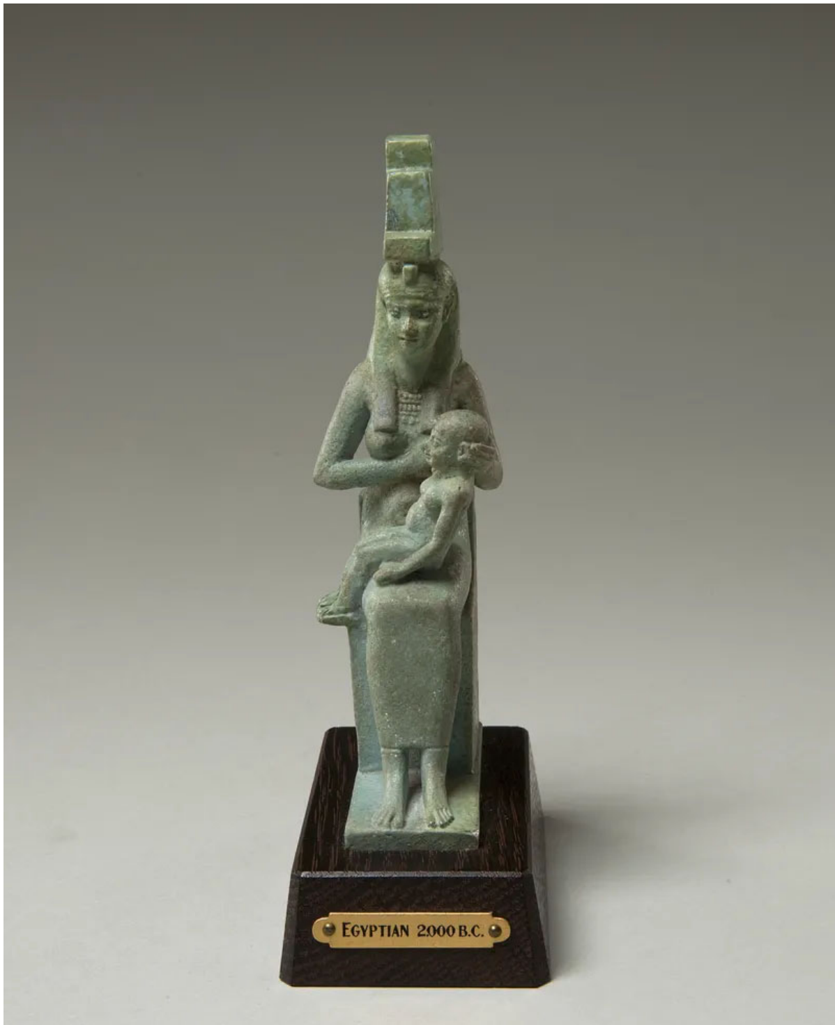
Statuette/Amulet of Isis and Horus is on display at the Barnes Foundation.

and Child depicts his wife nursing their firstborn son. The other sculpture is a statuette of ancient Egyptian god Isis with son Horus, whom she had to birth and raise in secret to protect him from a murderous uncle.