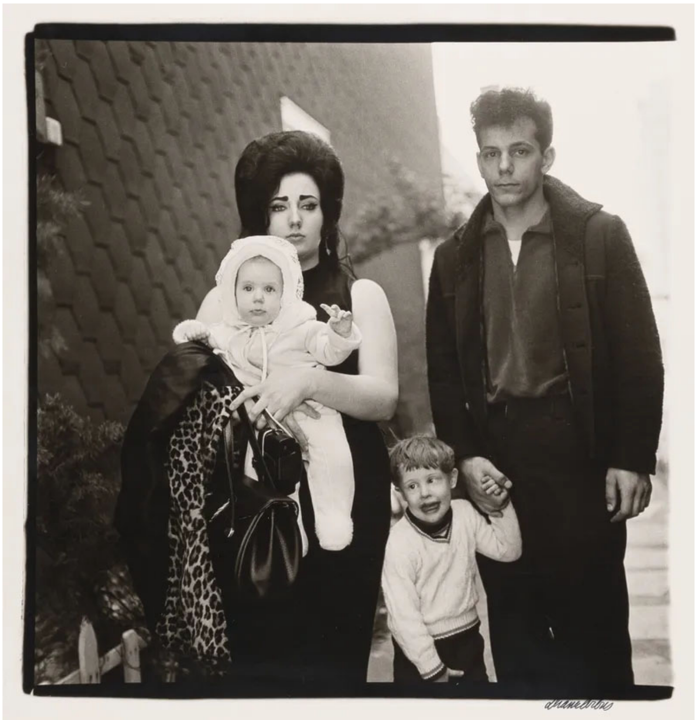
"A young Brooklyn family going for a Sunday outing, N.Y.C.," 1966, a gelatin silver print by Diane Arbus, on view at the Philadelphia Museum of Art.