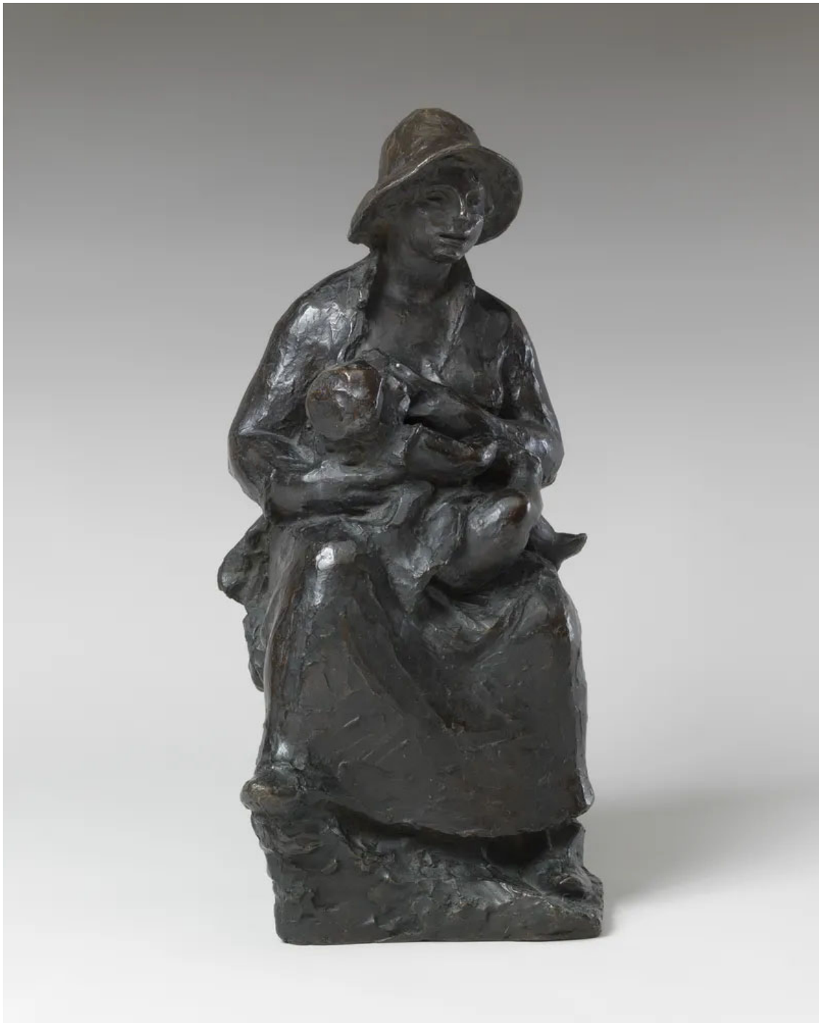
Pierre-Auguste Renoir's 1916 "Mother and Child" sculpture is on view at the Barnes Foundation.

( Writing Lesson ) to a mother leading her children to fish for mussels ( Mussel-Fishers at Berneval ). Also, check out Edouard Manet's Laundry .